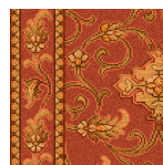
CORALLIN RUNNER 81/2289