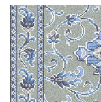
FORGET ME NOT RUNNER 92/20102