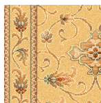
IVORY RUNNER 41/2289