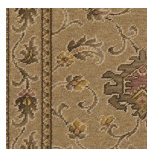
BRACKEN RUNNER 72/2289