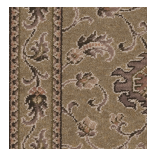
LEATHER RUNNER 52/2289