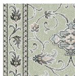
PISTACHIO RUNNER 31/20102