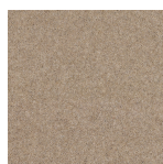
BEIGE IS BEAUTIFUL