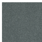
A TOUCH OF TEAL